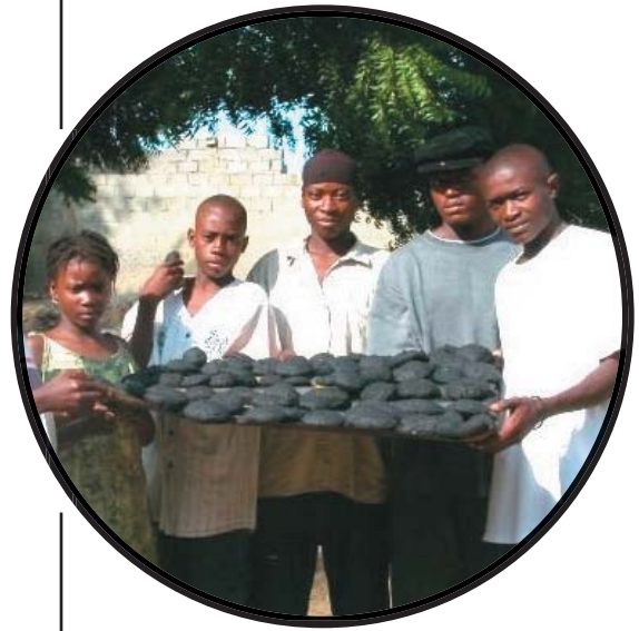
Students of the “Ecole de Charbon”